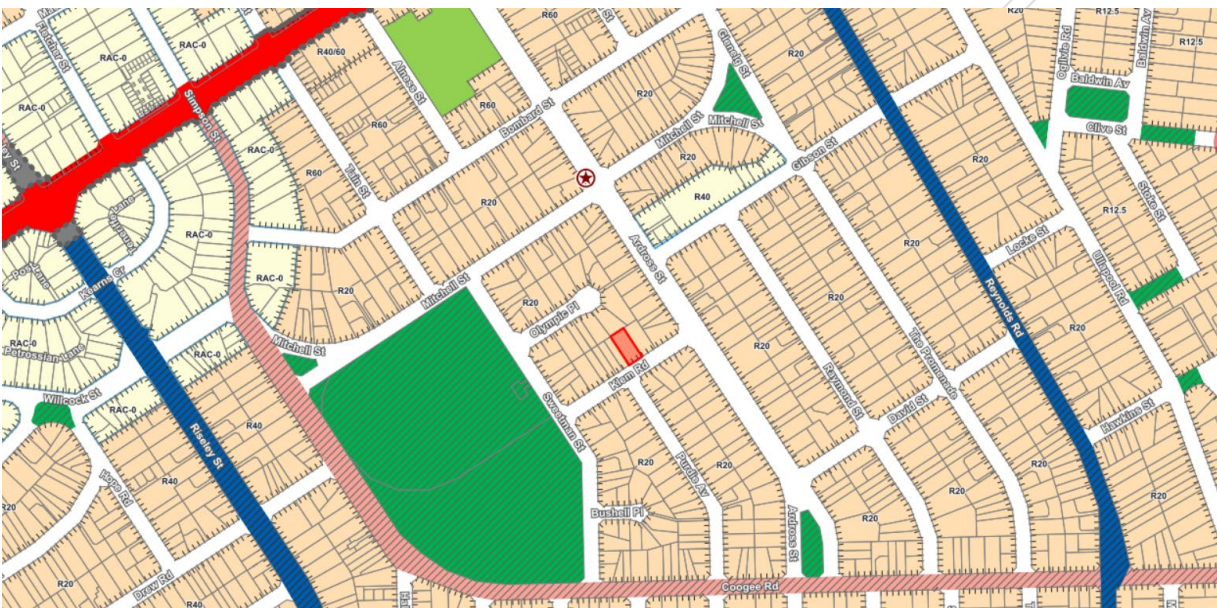
Figure 2: Zoning Map of subject site