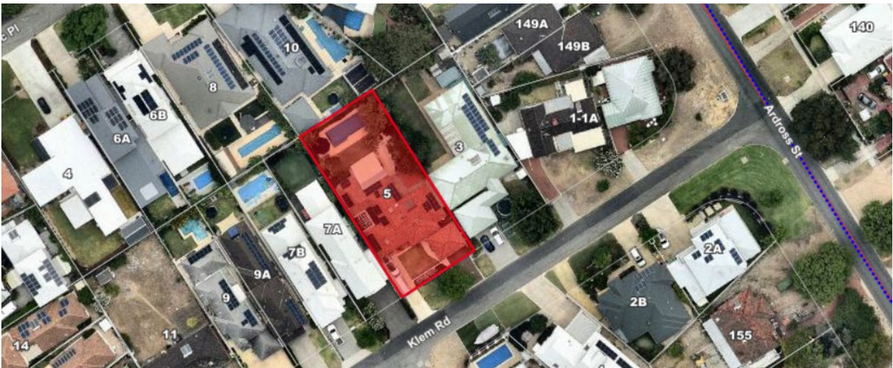
Figure 1: Aerial image of the subject site