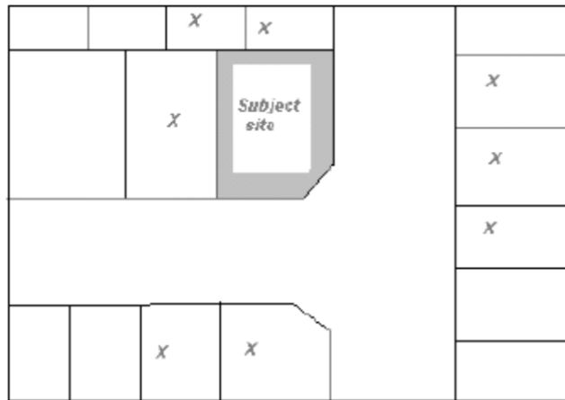
Diagram 2 – Typical ‘potentially affected’ properties for a development located within a corner property.