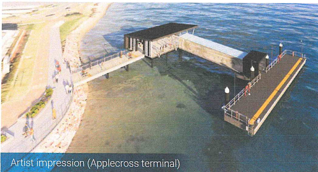
Artist impression (Applecross terminal)