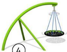
④ Basket swing