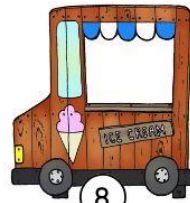
⑧ Ice cream van