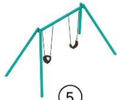
⑤ Traditional swing set