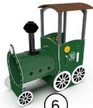
⑥ Train play unit