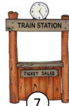
⑦ Train ticket office