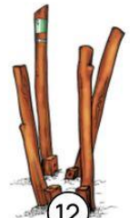
⑫ Stilt steppers