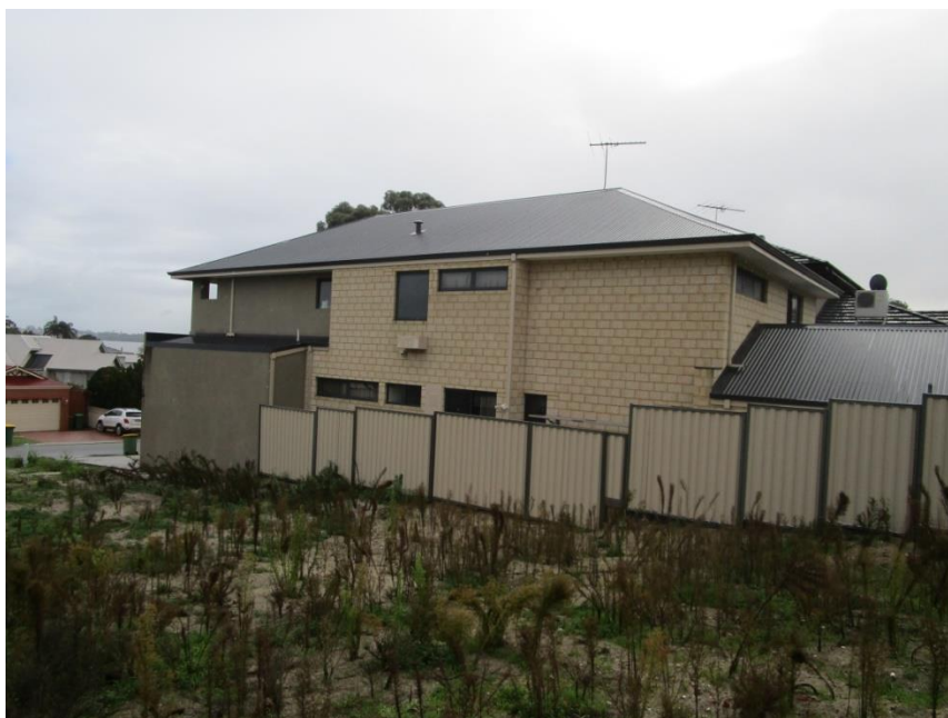
Figure 5: View of the neighbour's southern boundary from the subject site.