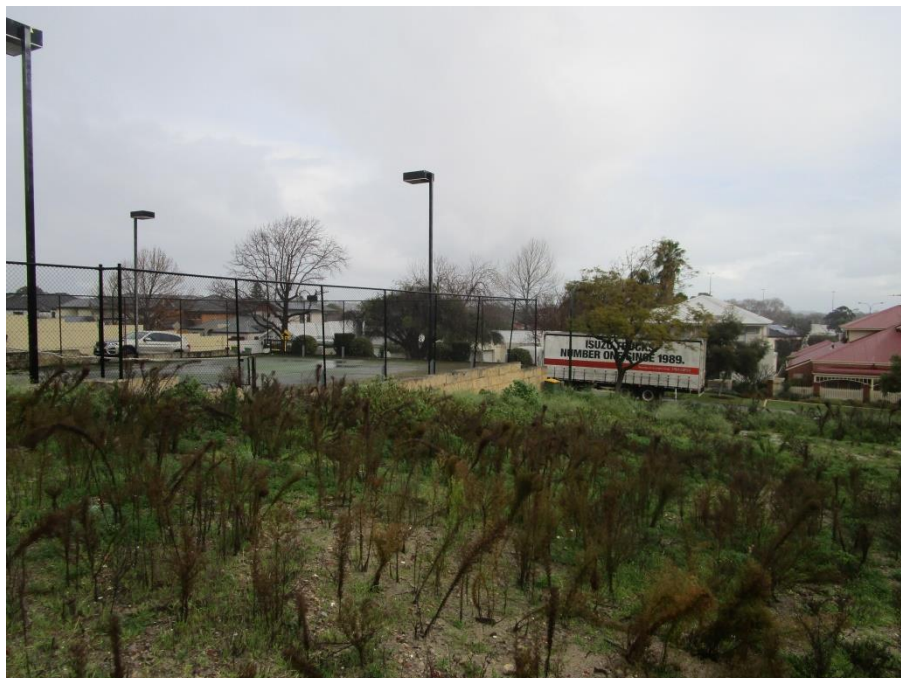
Figure 9: View south west from the subject property to the vacant lot at 40A Doney Street and the tennis court at 38 Doney Street.