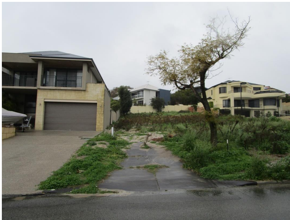
Figure 7: View of the vacant subject site. Note the large slope from the rear of the property to the street boundary.