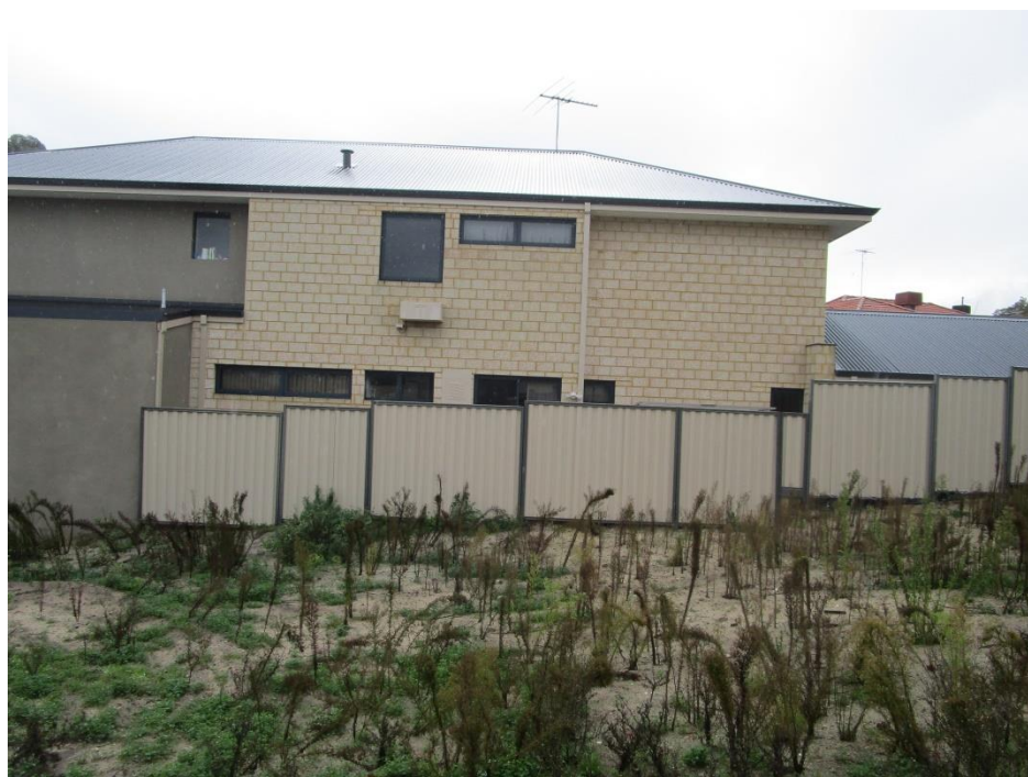
Figure 8: Southern elevation of the neighbouring property