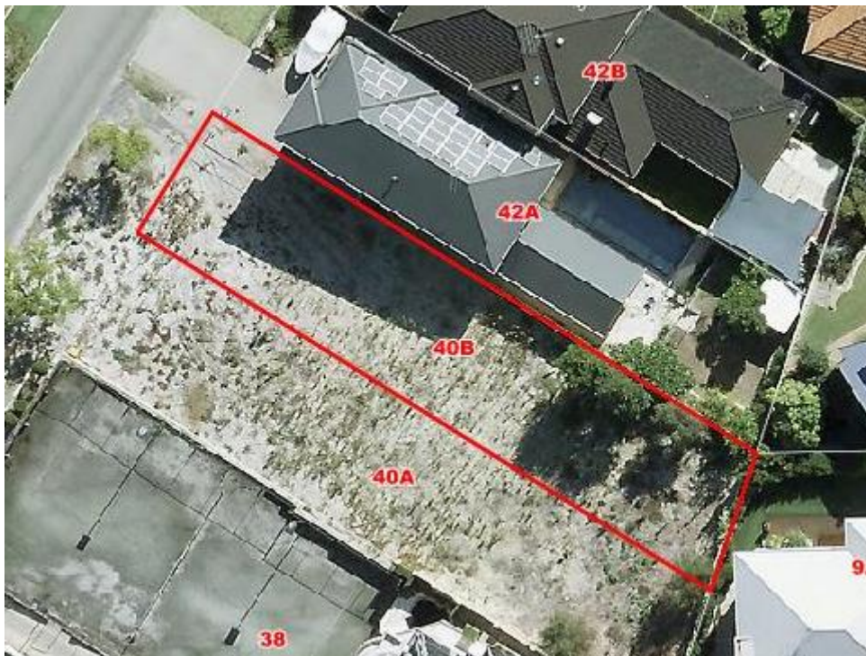
Figure 1 – Aerial Photography