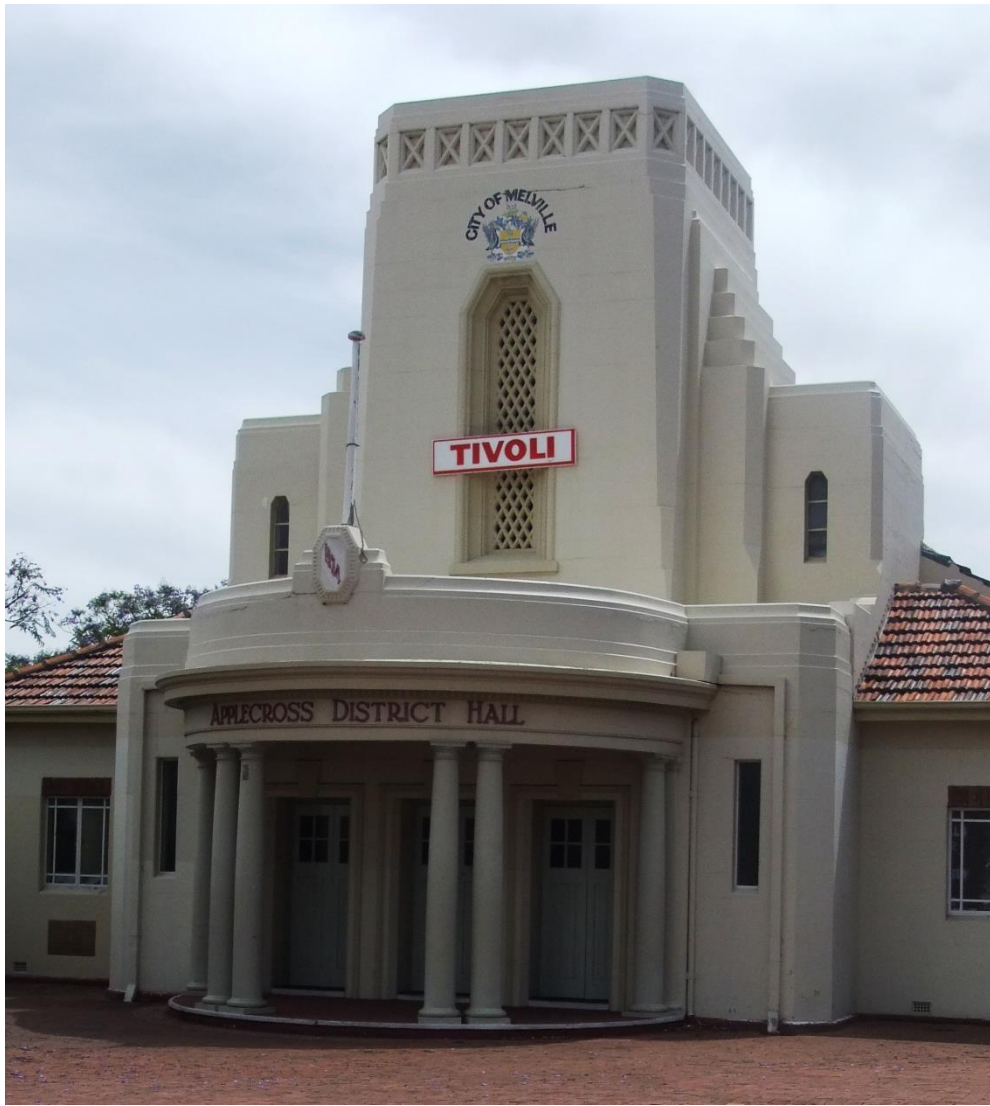
CITY OF MELVILLE LOCAL HERITAGE SURVEY 2019