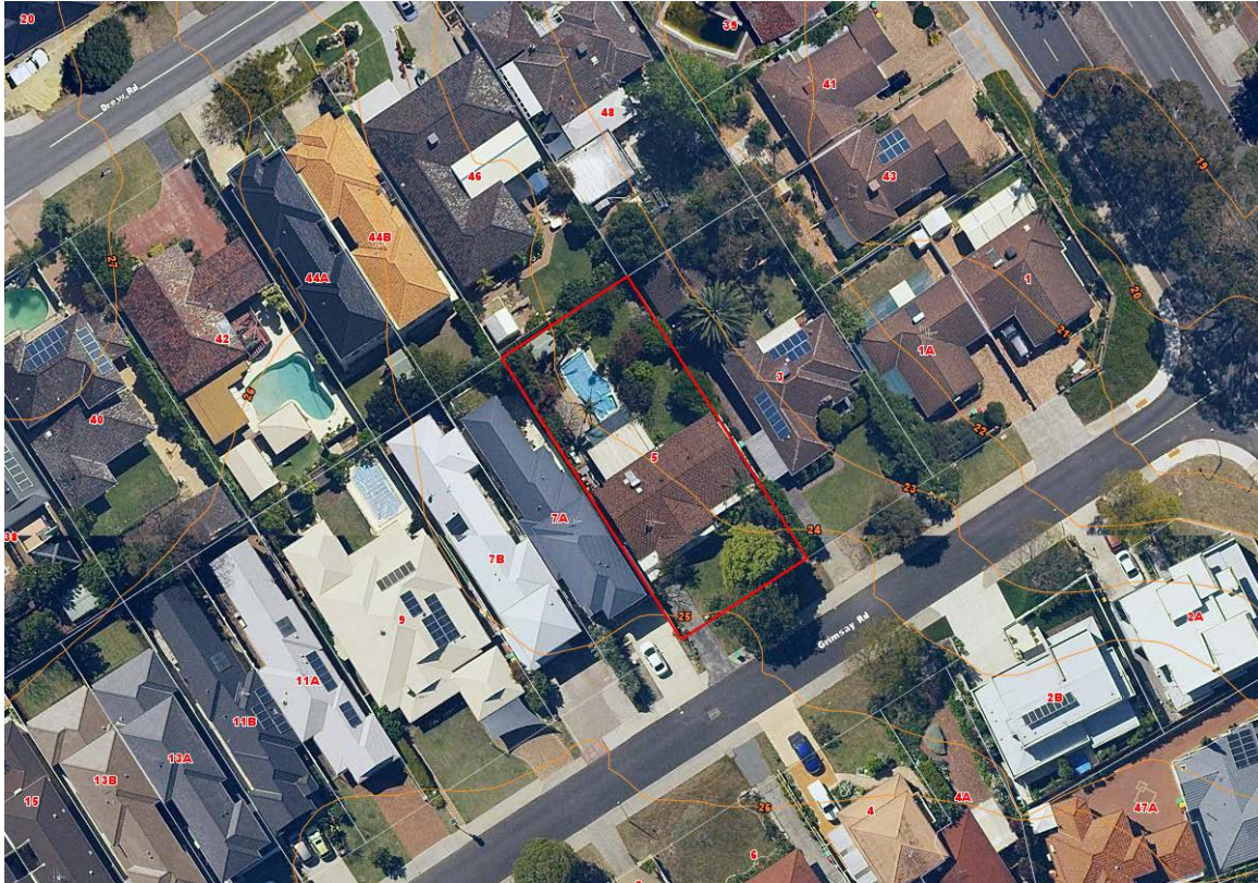
Figure 1 – Aerial Photography