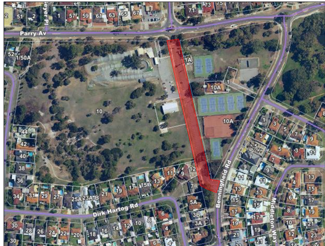
Unnamed Road Reserve through Bob Gordon Reserve, Bull Creek

Recommend initiating consultation on the above street names