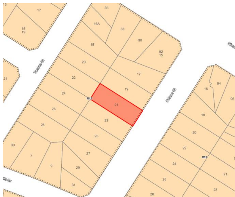
Figure 2: LPS6 Zoning Map Context with subject site marked in red