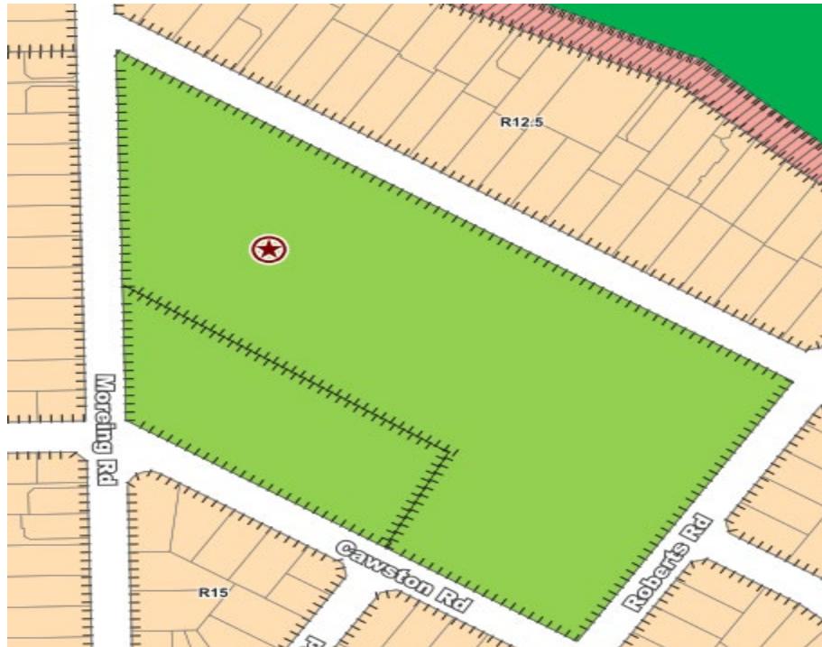
Figure 2: Zoning Map of the subject site.