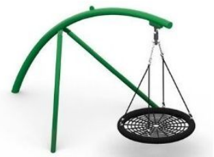
Basket swing 360 rotation included with every option