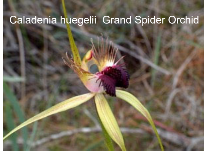
Caladenia huegelii Grand Spider Orchid