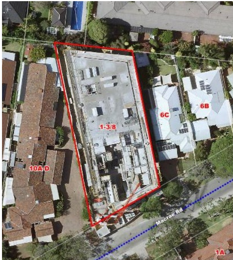
Figure 1: Aerial photograph of subject site