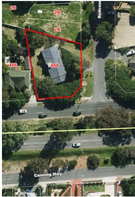
Figure 1: Aerial image of the subject site