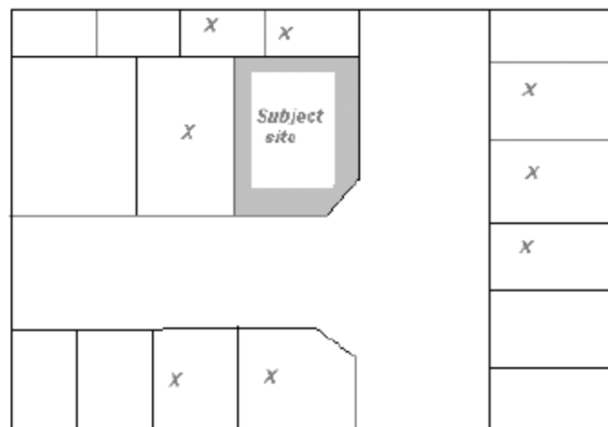
Diagram 2 – Typical 'potentially affected' properties for a development located within a corner property.