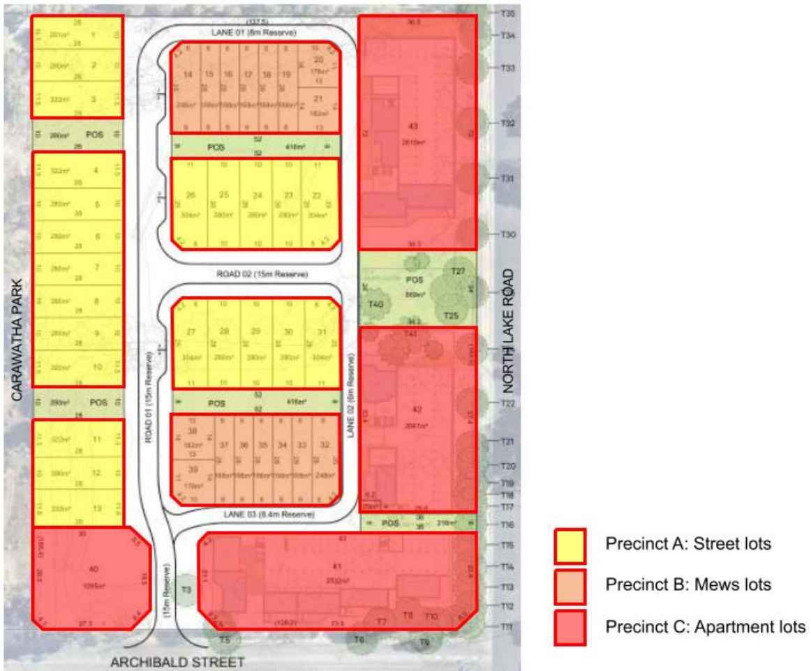
Figure 1: Precincts