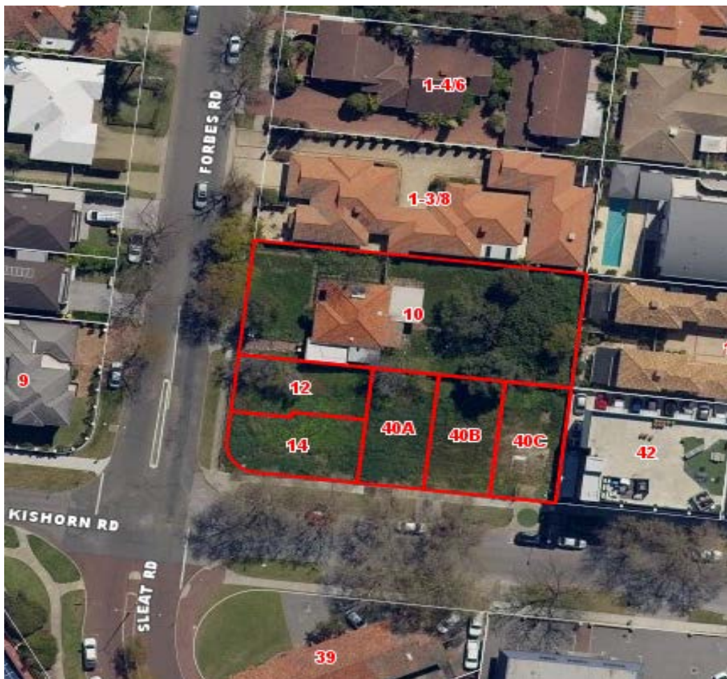
Figure 1: Aerial Map of Subject Site