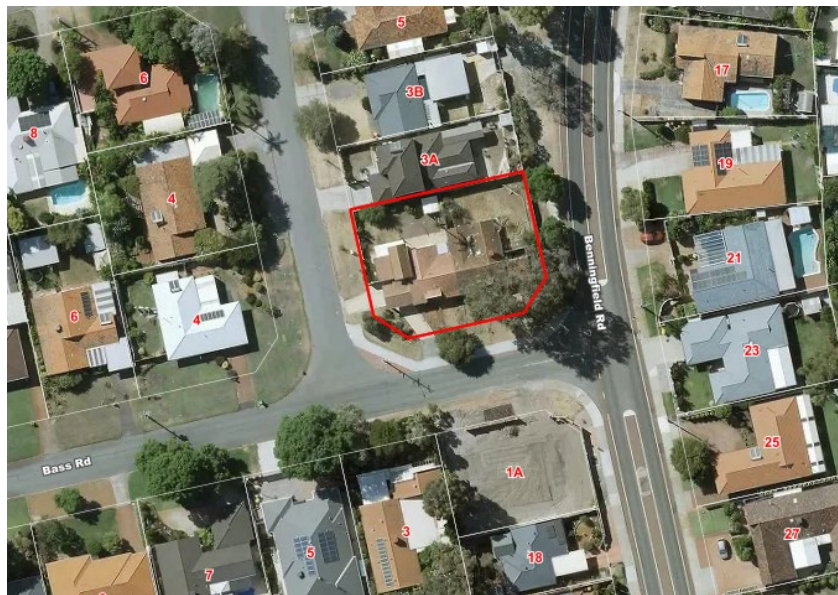
Figure 1: Aerial Image of the subject site