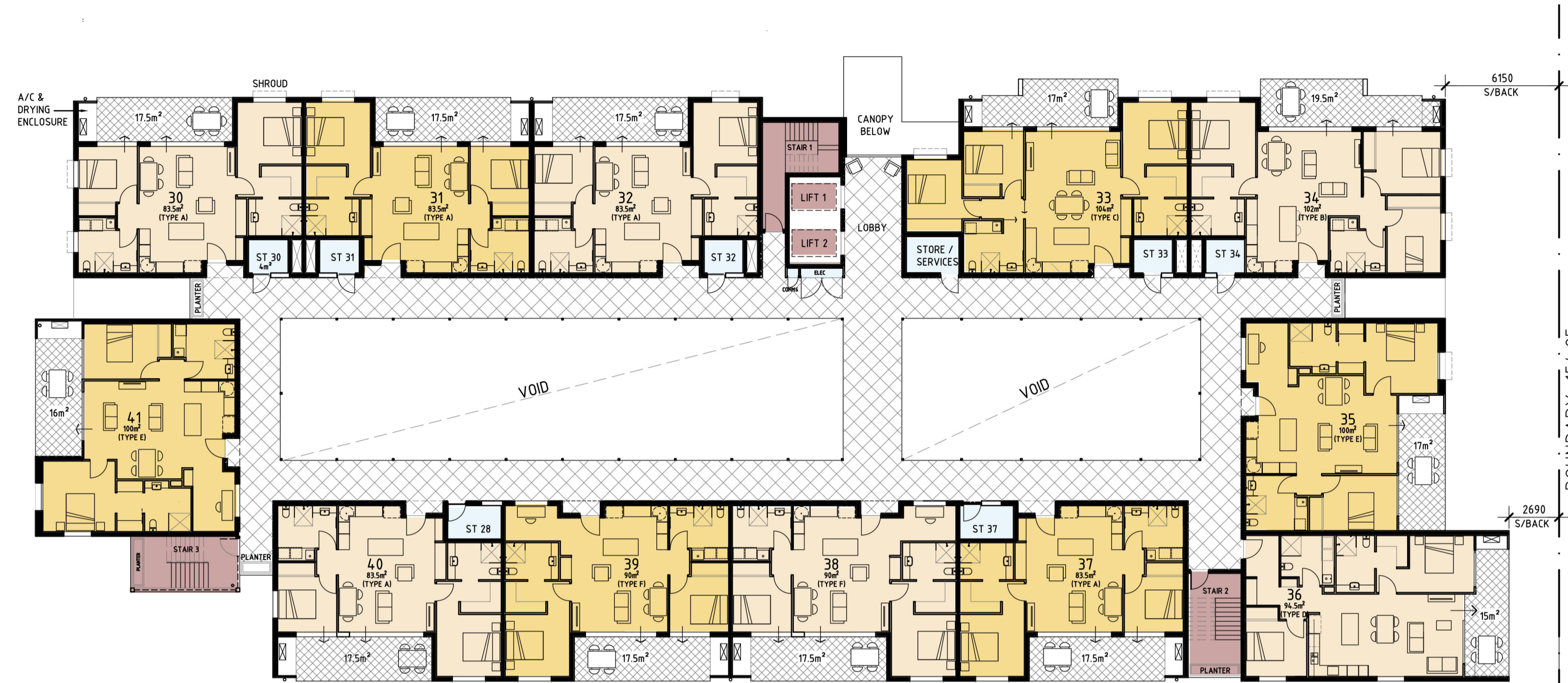
THIRD FLOOR PLAN Scale 1: 200