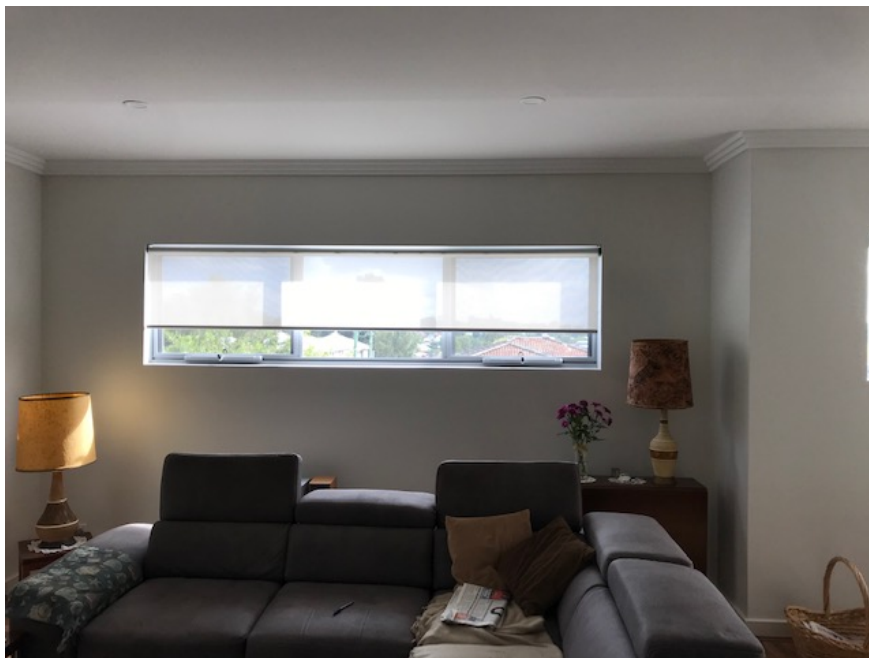
Figure 6: The living room window of Unit 6.