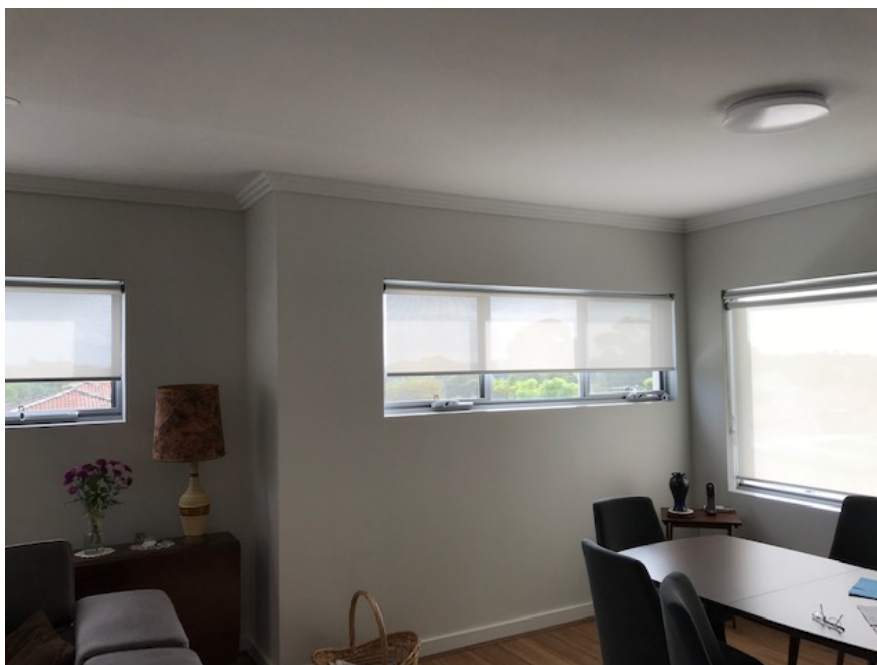
Figure 7: The dining room window of Unit 6