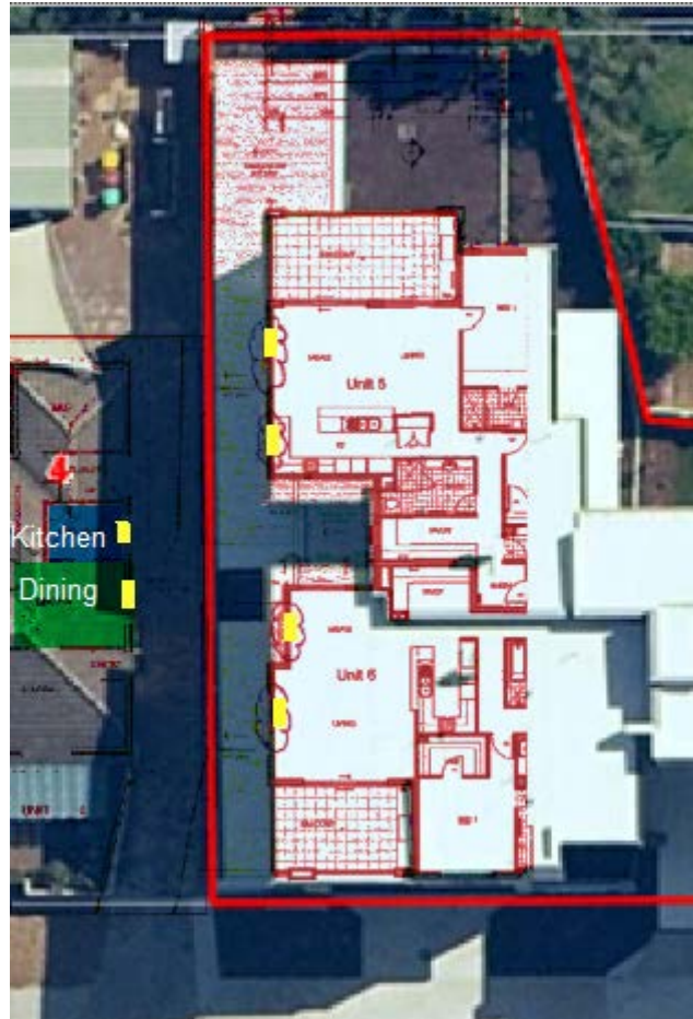
Figure 3: The subject 1 st floor windows in the western side elevation of the development has oblique rather than direct views of the adjoining neighbour's windows. (The windows are highlighted yellow, the blue box represents the neighbour's kitchen and the green box represents the neighbour's dining room).