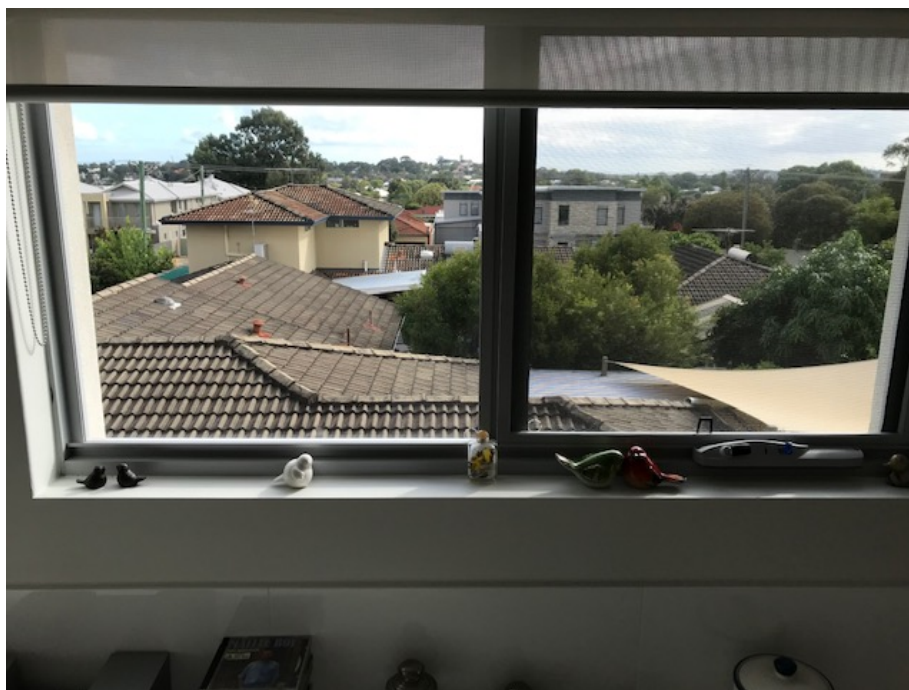
Figure 4: View from Unit 5's kitchen of the neighbour's property. The kitchen bench has the effect of limiting overlooking.