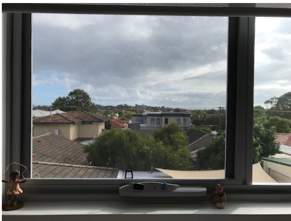
Figure 5: View from Unit 5's dining room of the neighbouring property. Note that this view is towards the roof, not the ground floor eastern side kitchen and dining room windows.