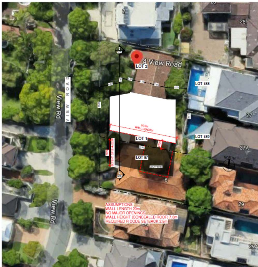
7. SHADOW PLAN - 2 LEVEL R-CODE COMPLIANT SETBACK 1 : 200