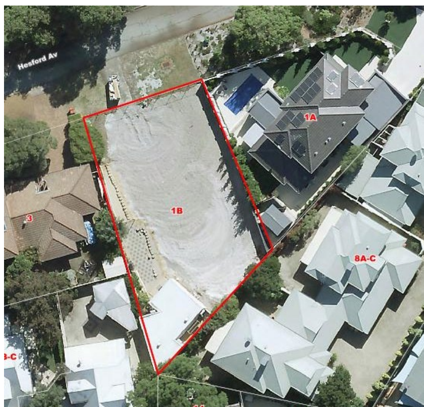
Figure 1: Aerial Photography – lot subject of this proactive street renumbering highlighted in red above