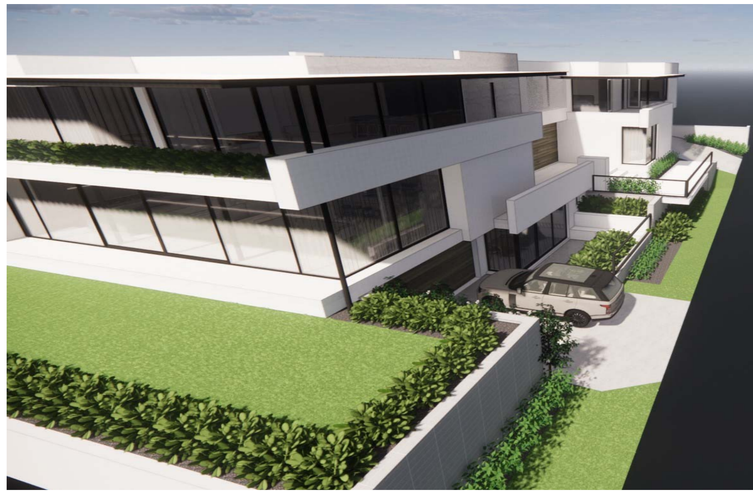
u'croft courtyard - Dee road