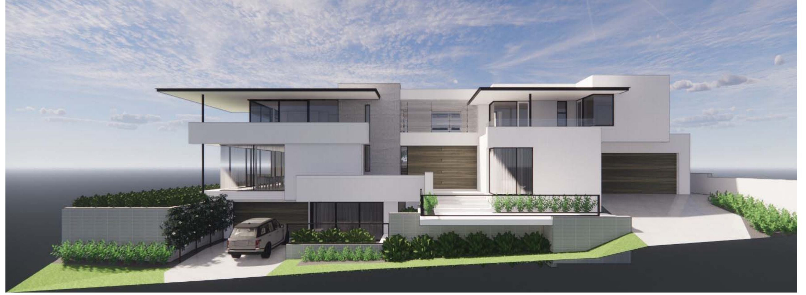
South elevation - Dee road