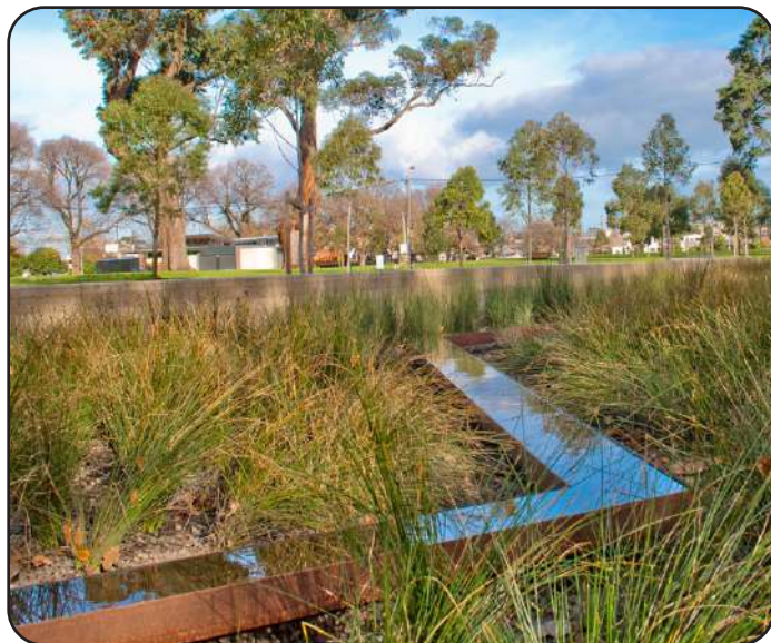
Water sensitive urban design (living stream)