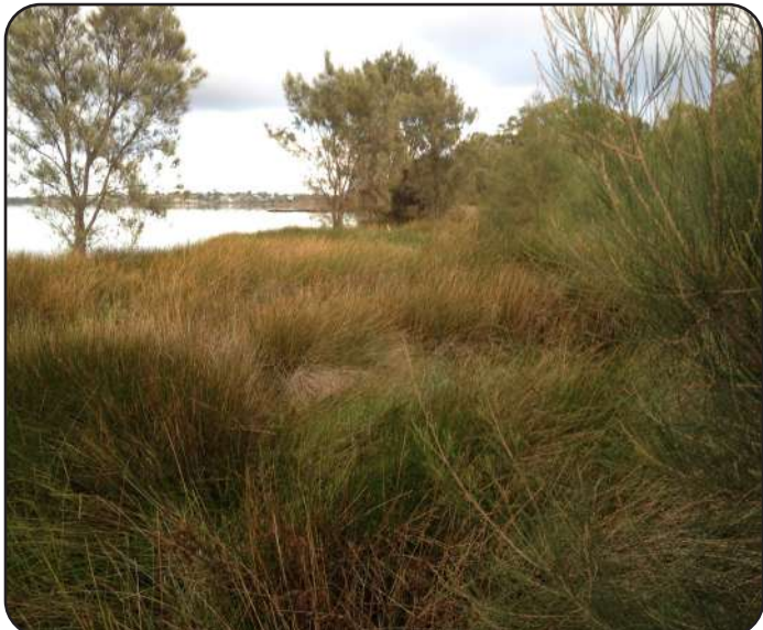
Sedges and rushes for foreshore buffer and sparse trees