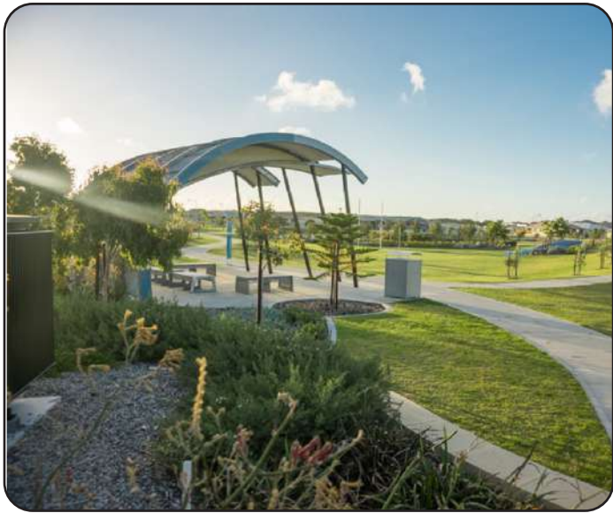
Shade, shelters and landscaping (amenity node)