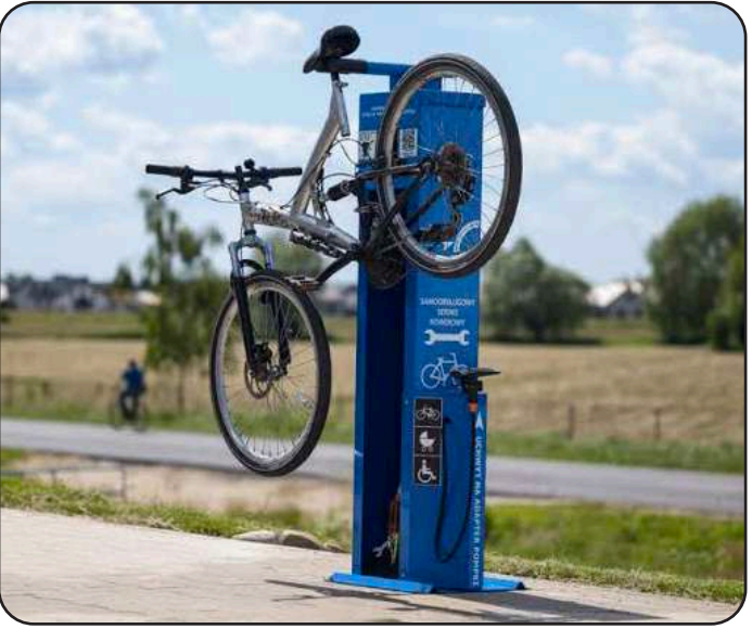
Bicycle maintenance station