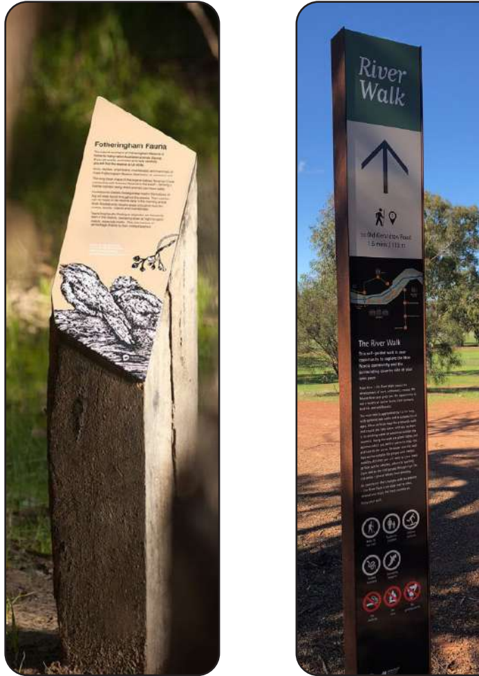
Interpretive and directional signage