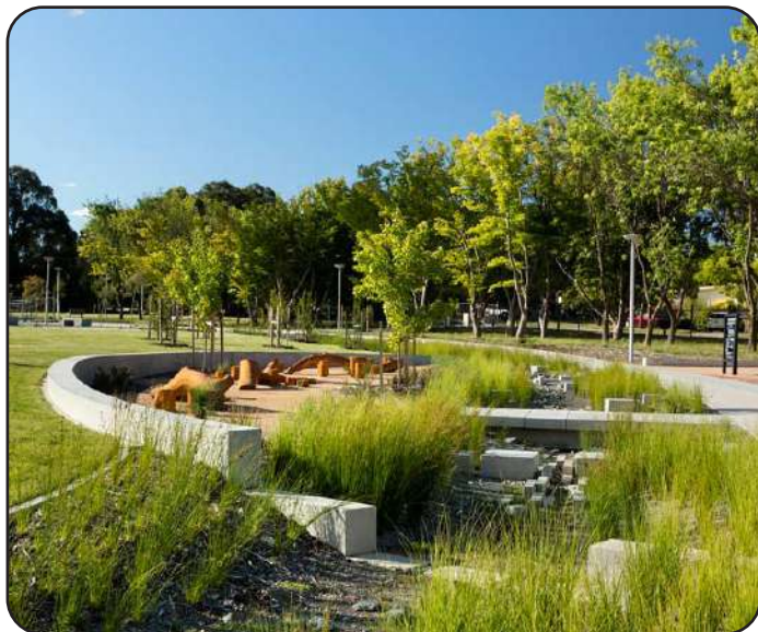
Water sensitive urban design (living stream)