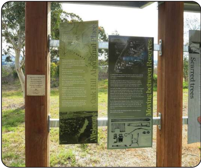
Interpretive and educational signage