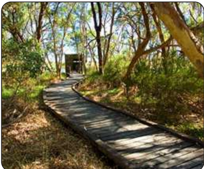
Boardwalk within native bushland