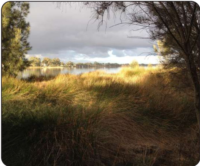
Sedges and rushes