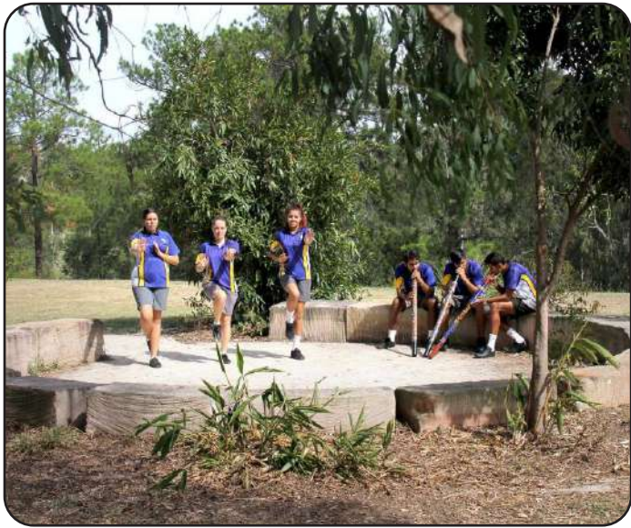
Aboriginal dance ceremony circle