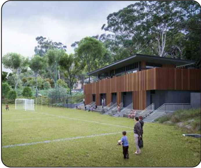
Double-storey eco-clubroom set amongst bushland