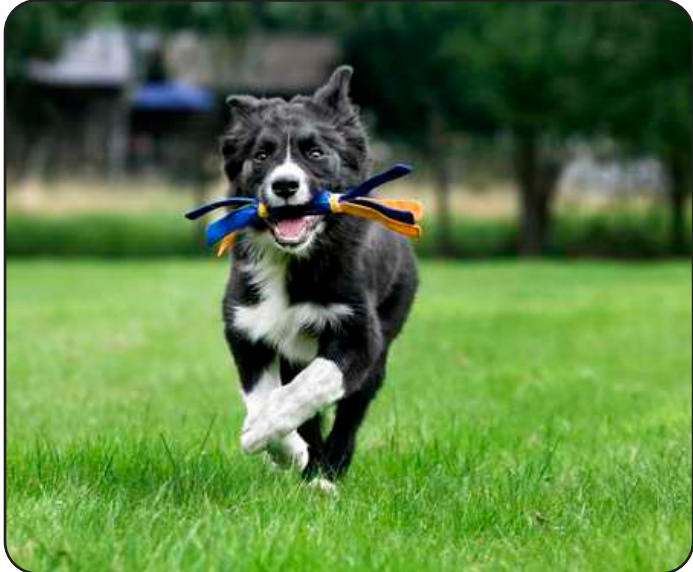
Dog off-lead exercise area