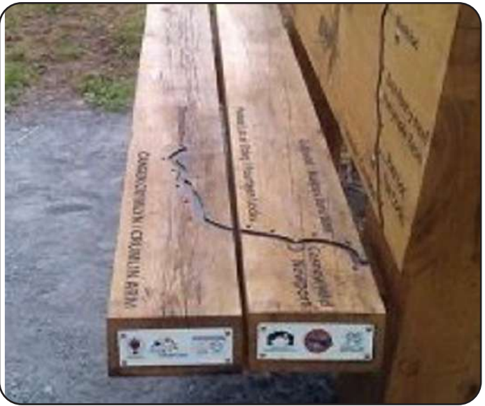
Interpretive seating spaces