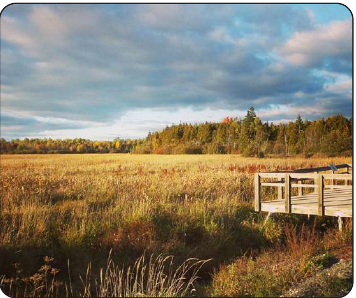
Lookout/ viewing platform