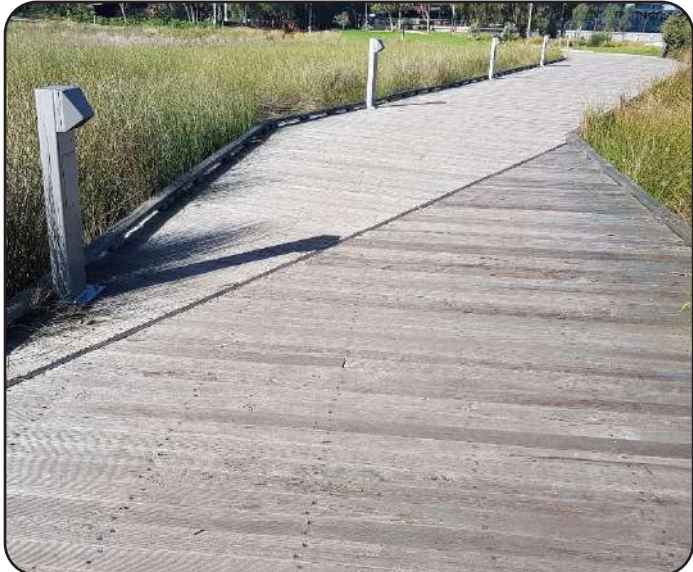
Boardwalk over living native plantings with environmentally sensitive lighting