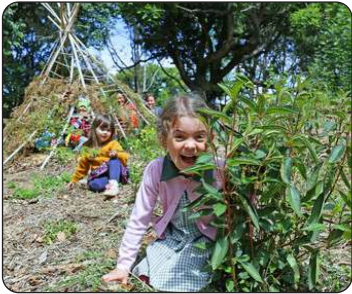
Bush tucker and sensory garden