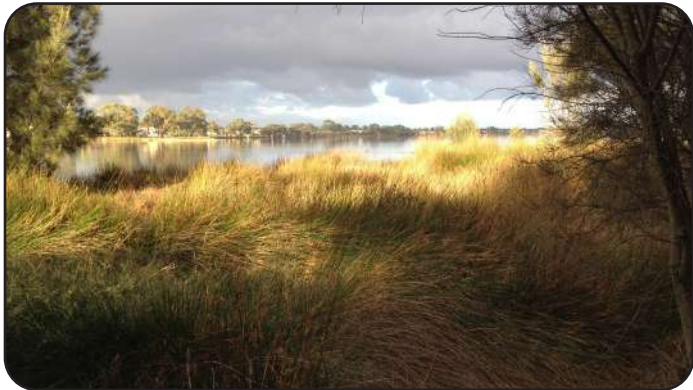
Sedges and rushes