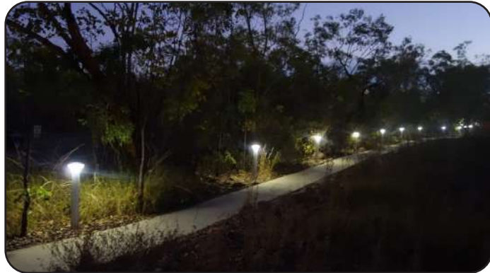
Environmentally sensitive lighting