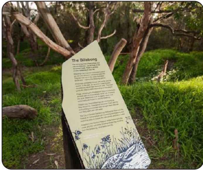
Educational and interpretive signage