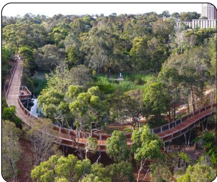
Elevated boardwalk over wetlands and native plantings