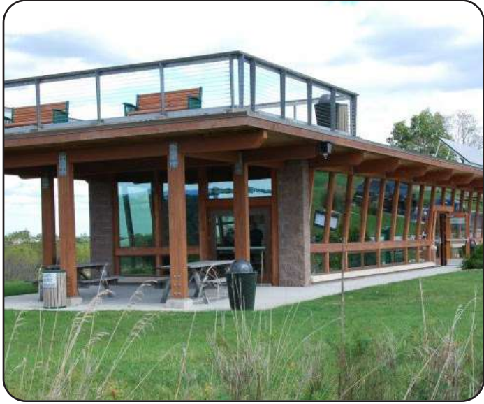
Eco-clubroom building with viewing platform (interpretive centre can be integrated)