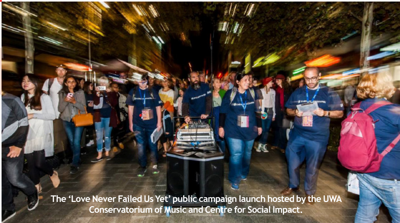
The 'Love Never Failed Us Yet' public campaign launch hosted by the UWA Conservatorium of Music and Centre for Social Impact.

You can read more about the Alliance and the Strategy at www.endhomelessnessWA.com