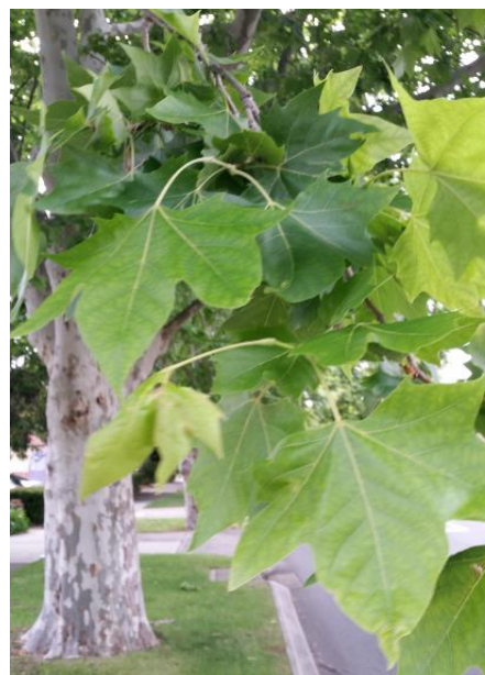
Above: Leaves of the London Plane Tree

This tree is considered to be a great urban tree as it is tolerant of pollution, drought and heat and grows in a range of soils.