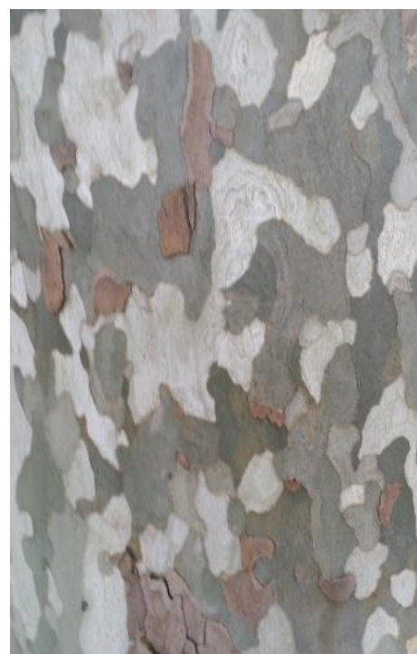
Above: Mottled bark of the Plane tree