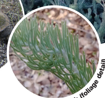
Woolly Bush (foliage detail)