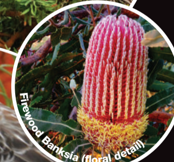
Firewood Banksia (floral detail)