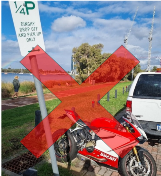
Example of signs

These areas will need a parking session to be active (does not apply for drop off bays) this can be done by paying by plate, purchasing a ticket or using the easypark app.