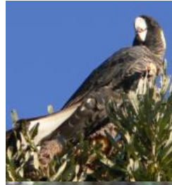
Carnaby's (Short-billed) Black Cockatoo Noongar: Ngolak