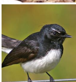
Willie Wagtail Noongar: Djitidjtdi