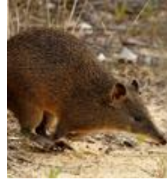
Southern Brown Bandicoot: Noongar: Quenda