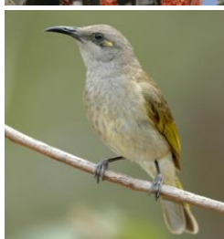
Brown Honeyeater Noongar: Djindjoko