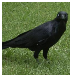
Australian Black Raven Noongar: Wodang, kwokom, karlo