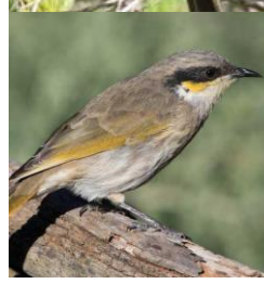
Singing Honeyeater Noongar: Dooromdorom