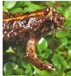
Clicking (Rattling) Froglet Noongar (frog): Kyooya