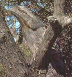
Tawny Frogmouth Noongar: Kambekor