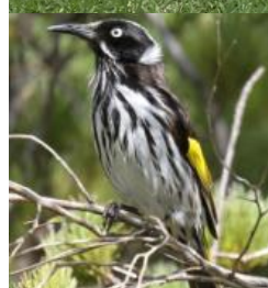
New Holland Honeyeater Noongar: Bandin