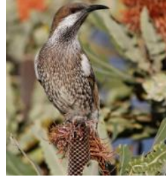
Western Wattlebird Noongar: Djoongong