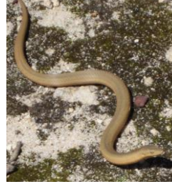
Burton's Legless Lizard

Thank-you to Piney Lakes volunteers, friends and staff for the photographs!