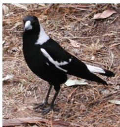
Australian Magpie Noongar: Koorbardi, koorbat

Take a walk around Piney Lakes Reserve and keep a tally of the animals you spot!