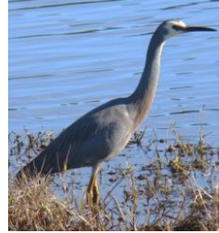
White-faced Heron Noongar: Wyan