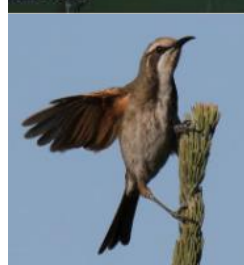
Welcome Swallow Noongar: Koonamit

Thank-you to Piney Lakes volunteers, friends and staff for the photographs!