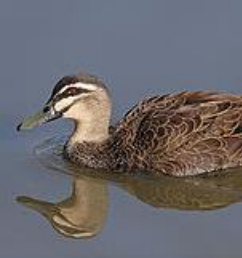
Pacific Black Duck Noongar: Ngoonana