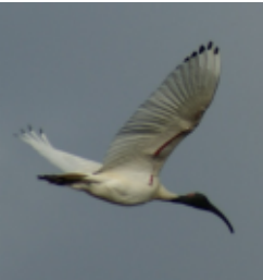
Australian White Ibis