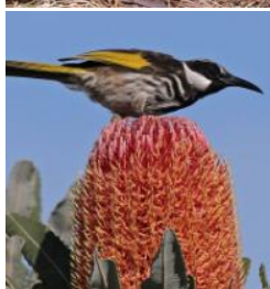
White-cheeked Honeyeater Noongar: Bandin