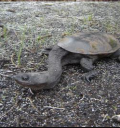
Long-necked (Oblong) Turtle Noongar: Yargarn