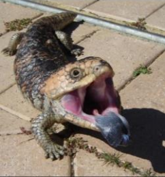
Bobtail Lizard Noongar: Yourn