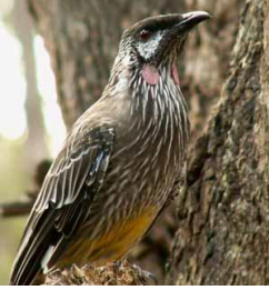
Red Wattlebird Noongar: Doongorok, wadjalok, djoongong