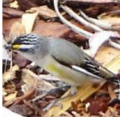
Striated Pardalote Noongar: Widopwidop