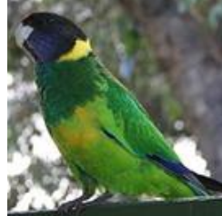
Western Ring-neck (28) Parrot Noongar: Dowarn