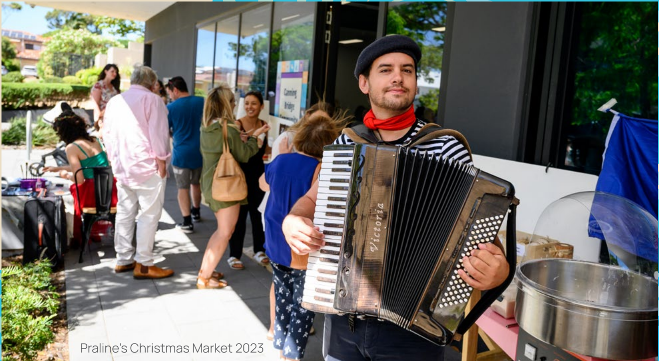
Praline's Christmas Market 2023