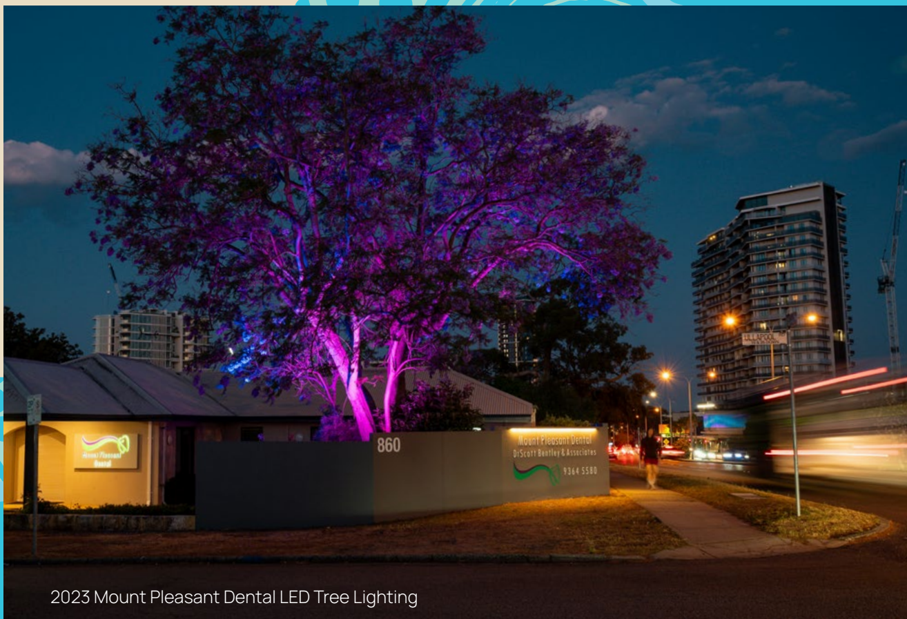
2023 Mount Pleasant Dental LED Tree Lighting