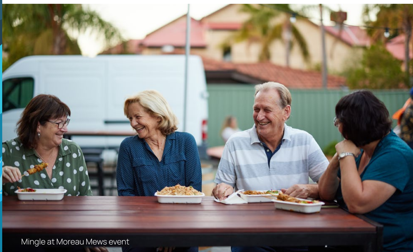
Mingle at Moreau Mews event