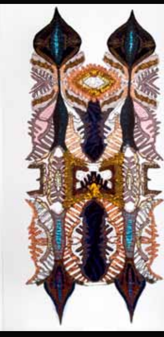
Elizabeth Morley, Twin Totems , 2002, Textile (Embroidery) mounted in Perspex