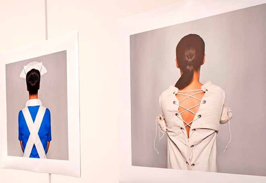
Eva Fernández, Straightjacket and Nurse , 2012, Archival Inkjet Print