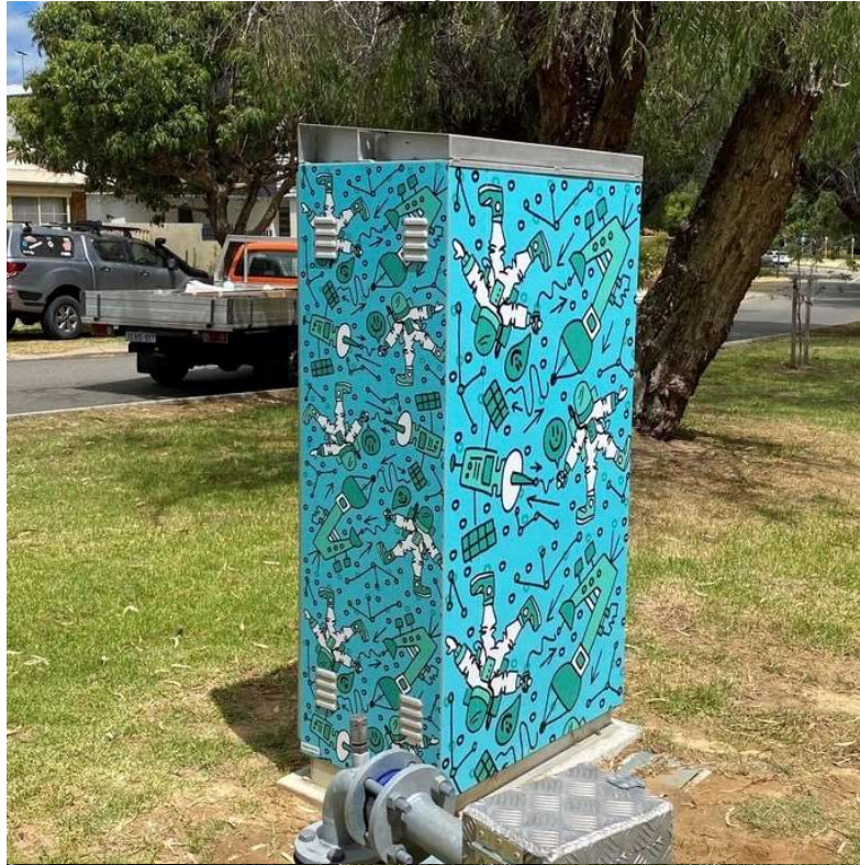
Examples of past artworks