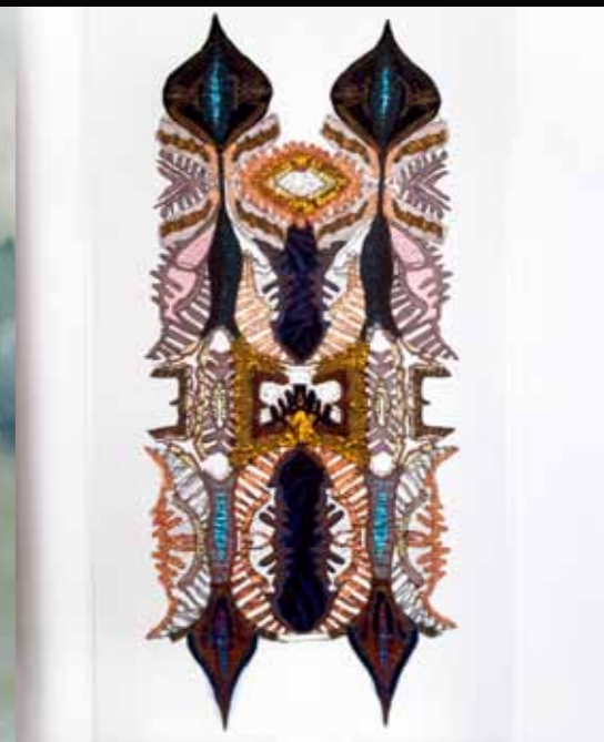
Elizabeth Morley, Twin Totems, 2002, Textile (Embroidery) mounted in Perspex