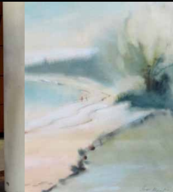
Ivor Hunt, Point Dundas, 1963, Watercolour (detail)