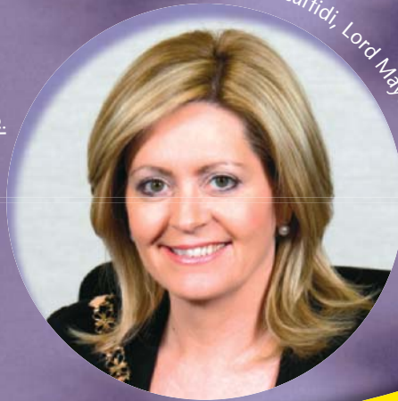
Lisa Scaffidi, Lord Mayor, City of Perth