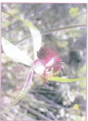
Rusty Spider Orchid ( Caladenia ferruginea ) Flowers September- October 20cm herb

The signs on the Wildflower walk are colour photographs, which show you in exquisite detail how special the local WA Wildflowers are. They also inform you about the growth habit and size of the plant so you can try and spot it in the bushland on your walk