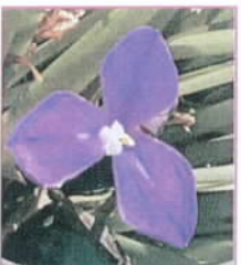
Pink Fairy Orchid