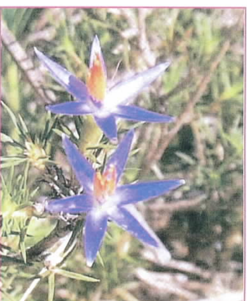
Tinsel Lily flowering at Wireless Hill

Enjoy a walk on our special wildflower walk through Wireless Hill and learn about the often small and intricate native flowers, which are local to this lovely bushland.