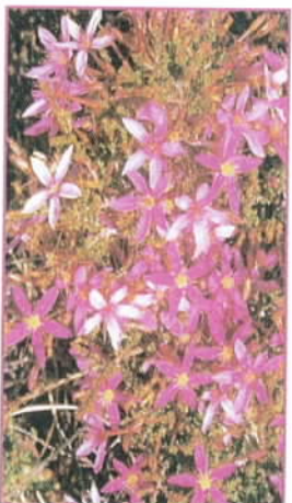
This Pink Calytrix flowers in mid summer

Wildflowers in the reserve can be seen almost all year round, and you can use the path to spot wildflowers in their natural habitat from the path itself.